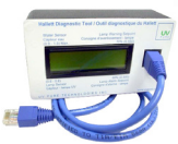
Hallett Diagnostic Tool (Optional on all models)