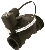
Automatic Shut-off Solenoid Valve (Optional on all models)