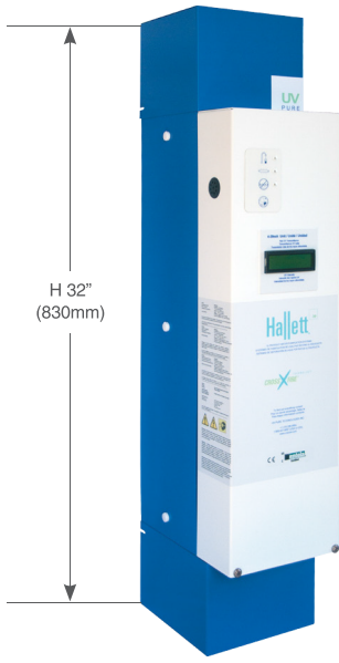
Hallett 30 4-20mA Data Output