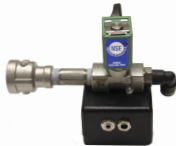
External Purge Valve (Optional on all models)